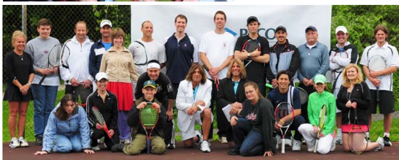
Our tennis teams and some of our students