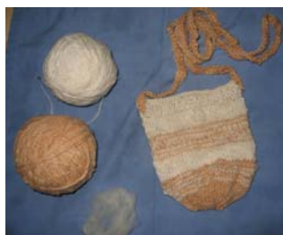
The bag the children made for Elsbeth

Kindergarten: Kindergarteners processed wool from sheep to make a special gift for Elsbeth, their music teacher. The children helped to clean and card the wool, helped a bit with the spinning, dyeing, and rolled it into a ball ready for knitting.