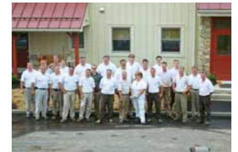
Silver Maple, a new student residence, and The Sarah Jane Herman Education and Resource Center will open officially on September 24, 2011. The new buildings serve eighteen to twenty-one-year-old students in our Transition Program at Beaver Farm.