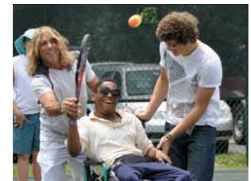
New on tournament day this year was a tennis clinic for kids of all ages and all abilities!