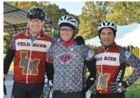
Perfect weather and fabulous foliage attracted nearly 300 riders at last year's Camphill Challenge.

Best of all, all proceeds from the Camphill Challenge benefit Camphill Special School and our sister communities in Chester County, Camphill Village Kimberton Hills and Camphill Soltane.