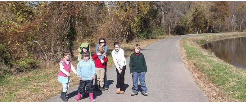
Grade five takes a class trip along Beaver Run, a corridor of French Creek which is part of Pennsylvania's Designated Scenic Rivers Program.