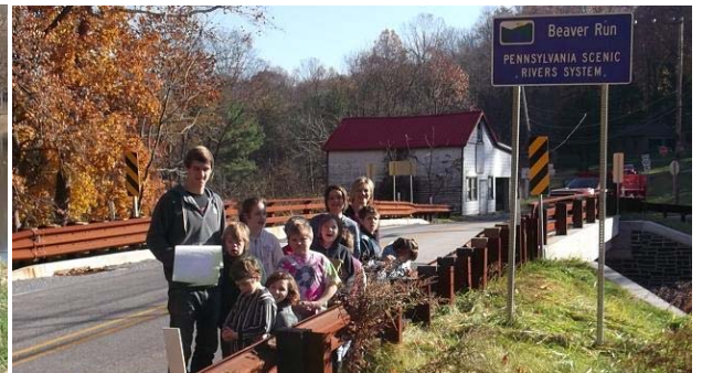
See Classroom happenings on page 3 for the story.