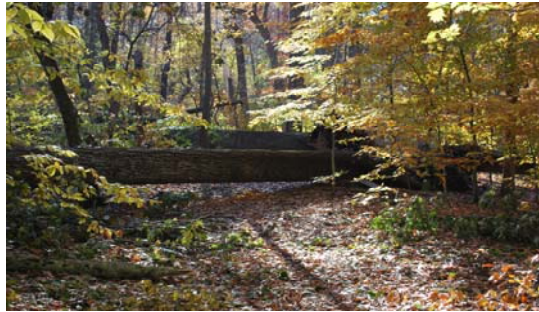
The three mighty oak trees that had grown together were lost to the early snow.

While the unusual October 29 th snowstorm was beautiful to look at from the warmth of our homes, and it was great fun to slide down the huge hill at Beaver Run so early, it also caused the loss of a dear friend. In the woods along the far side of Beaver Run, three giant oak trees that had grown up together from the same base and seemed as one tree, succumbed to the heavy wet snow that fell upon the leaves. Each tree was huge, perhaps 250 to 300 years old. It would make a wonderful story to know what those forest